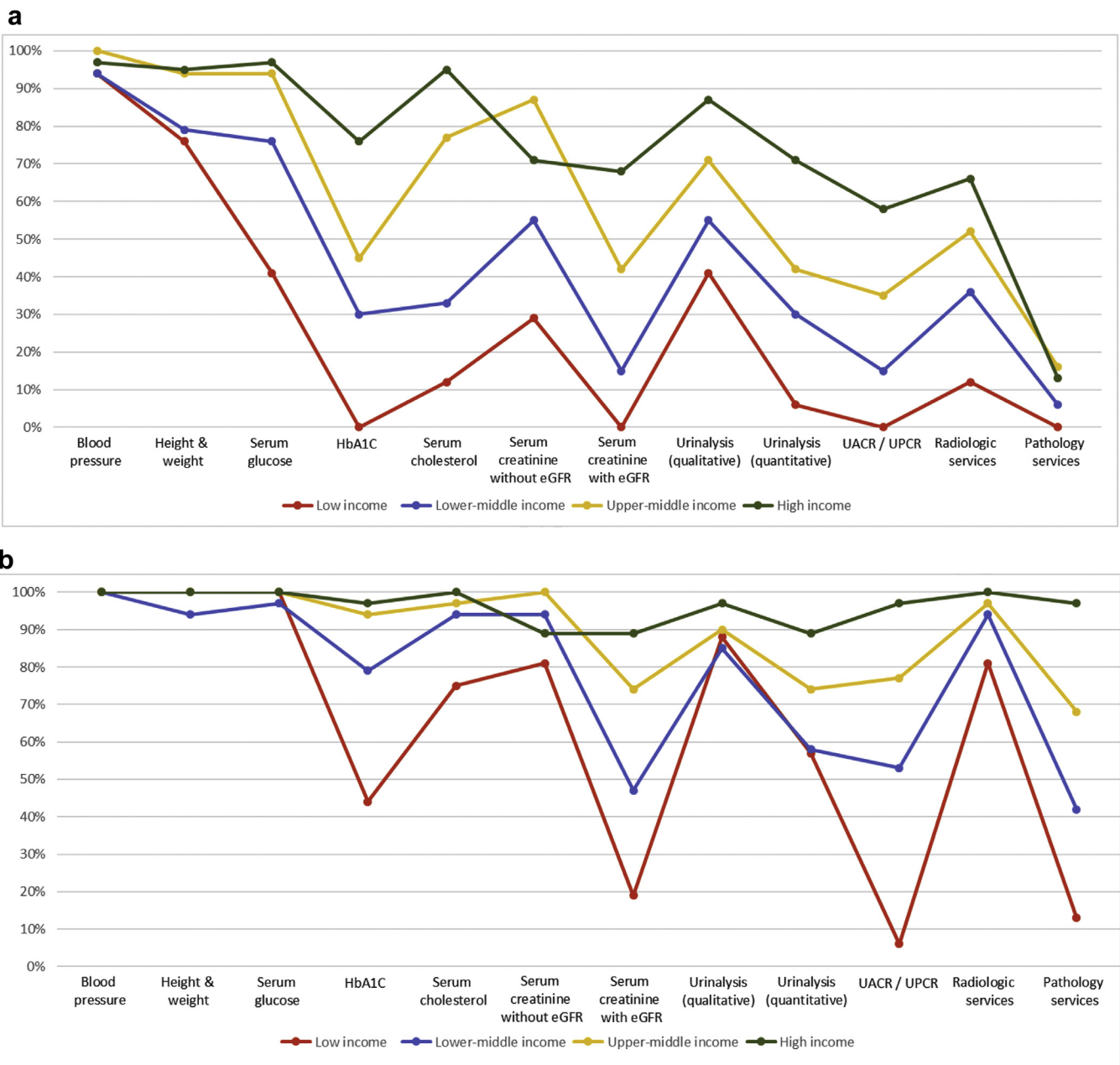
Figure 1 | Health care services for identification and management of chronic kidney disease by country income level. (a) Primary care (i.e., basic health facilities at community levels [e.g., clinics, dispensaries, and small local hospitals]). (b) Secondary/specialty care (i.e., health facilities at a level higher than primary care [e.g., clinics, hospitals, and academic centers]). eGFR, estimated glomerular filtration rate; HbA1C, glycated hemoglobin; UACR, urine albumin-to-creatinine ratio; UPCR, urine protein-to-creatinine ratio. Data from Bello et al. 4 and Htay et al. 42

low-income regions. For instance, more than 90% of upper-middle-income and high-income countries reported having chronic peritoneal dialysis services, whereas these services were available in 64% and 35% of low-income and lower-middle-income countries, respectively. In comparison, acute peritoneal dialysis had the lowest availability across all countries. More than 90% of upper-middle-income and high-income countries reported having kidney transplant services, with more