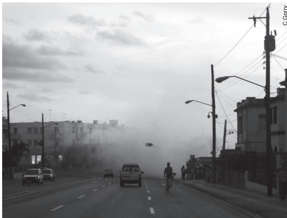
Fumigating at-risk neighborhoods in Havana

In order to maintain effective surveillance and control over time as lower risk perception and fumigation fatigue set in, two new plans are being set in motion: the Phase II Plan and the Sustainability Plan. The first is designed to kill larvae before they hatch by treating standing water and spraying interior walls, exterior areas and water tanks with larvicide. Cuban industrial and biotechnology sectors have joined the fight as well: locally-produced repellent and biolarvicide drops for treating standing and stored water are now sold in stores and pharmacies, and in-home foggers will be available for purchase soon.