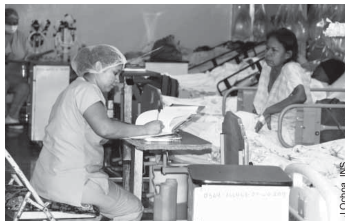
The Nefrolempa study contributed to improved nephrology services at San Juan de Dios National Hospital.

Reliable data on the extent and patterns of the disease are helping this hospital in San Miguel, El Salvador's second-largest city, improve services, cut costs and better serve the public's health. The study also helped equip and design the hospital's new nephrology unit and provided “expert guidance for evalu-