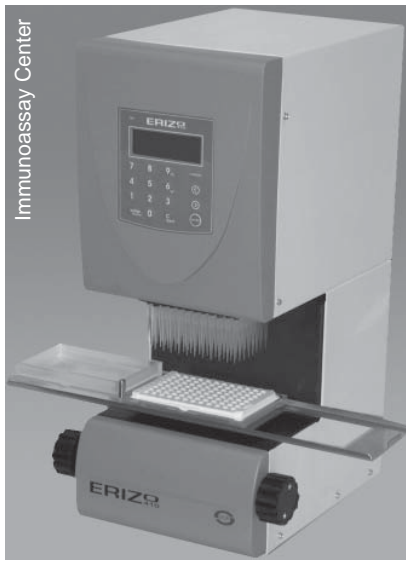
Multichannel pipettes dispensing reagents and specimens manufactured in Cuba help provide sustainability to the health system.

some half a dozen countries, including Brazil, Argentina, China and Mexico.[9] The Cuban approach—locating laboratories near patients, CIE certification courses for technicians, strategicallyplaced servicing and maintenance branches—is adapted to each site. The most popular products internationally are the SUMAsensor, reagents and an innovative cytology kit—one of CIE's newest products—developed jointly with the National Cancer Control Unit and the Cervical Cancer Early Diagnosis Program. International demand for CIE technologies and instruments (all of which undergo external evaluations and adhere to international quality control and certification standards) is growing—so much so that CIE is currently working at double capacity and is expanding its physical plant to keep pace.