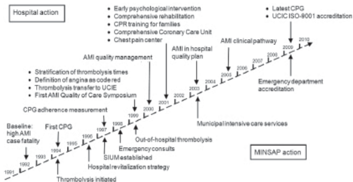
Figure 1: Main initiatives in management of acute myocardial infarction, Dr Gustavo Aldereguía Lima University Hospital, Cienfuegos, Cuba, 1994–2009

AMI: Acute myocardial infarction CPG: Clinical practice guideline MINSAP: Ministry of Public Health SIUM: Integrated Emergency Medical System UCIC: Comprehensive Cardiac Care Unit UCIE: Emergency Intensive Care Unit