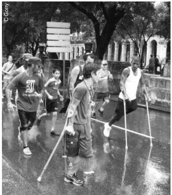
Despite slick streets and grey skies, the spirit of Terry Fox lived on at this year's Run in Havana.