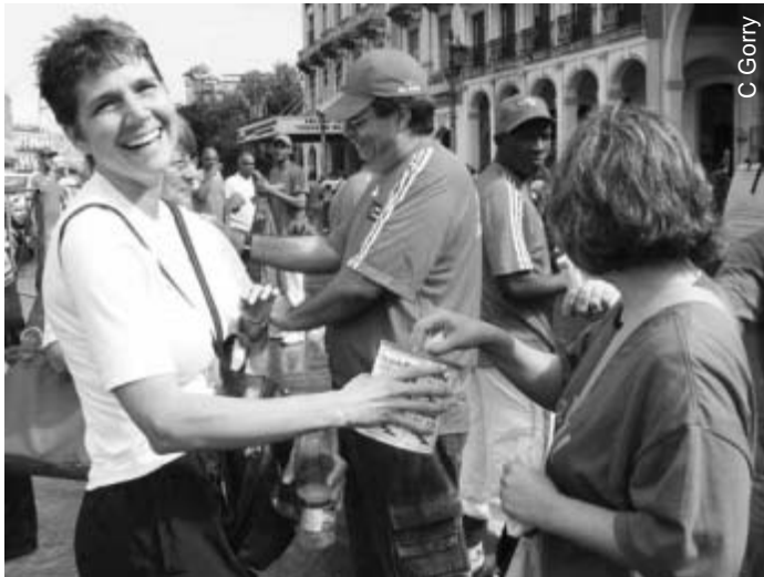
A Canadian volunteer collects money at Havana's Terry Fox Marathon of Hope.

Unlike participants in some other countries, runners in Cuba's Marathon of Hope don't collect donations from sponsors. How, then, does a small, poor country like Cuba raise funds for cancer research, and where does the money go?