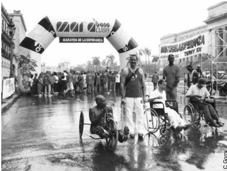
Ready, set, go! The rainy starting line of Cuba’s 11th annual Terry Fox Marathon of Hope.

“Even if I don’t finish, we need others to continue. It’s got to keep going without me,”[1] said Terry Fox as he ran across Canada. Little did the young athlete know that nearly 30 years after uttering these determined words, the world would continue, unflinchingly, to run, walk, cycle, and skate to raise money for cancer research. Ultimately, Terry didn’t finish, forced to abandon his “Marathon of Hope” when the cancer that took most of his right leg spread to his lungs. But the heroic amputee had already run a marathon a day—over 3,300 miles—and reached his goal of collecting a dollar for every Canadian to fight cancer. That initial CAD$24 million has ballooned to more than $400 million and keeps on growing thanks to the Terry Fox Run for Cancer Research. First held in 1991, the Run is the world’s largest single-day cancer research fundraiser. And the single largest participant country in that event is Cuba.