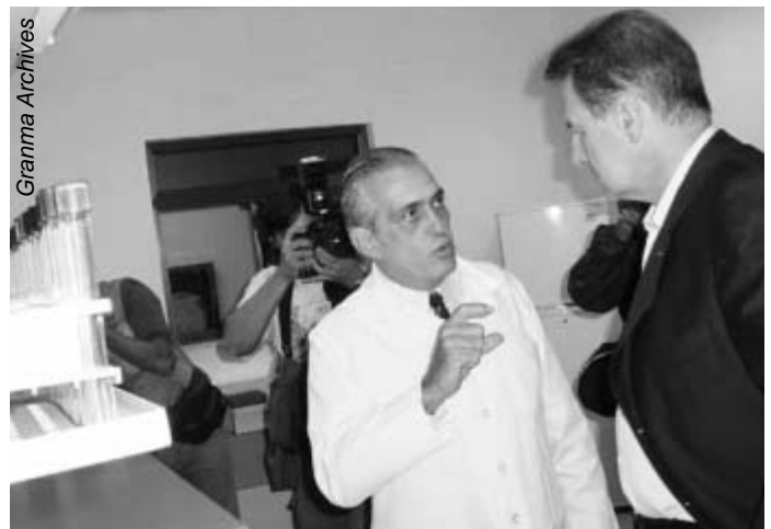
International Olympic Committee President Jacques Rogge (r) at the Havana Anti-Doping Laboratory in 2002.

Located in Havana, the Cuban Sports Medicine Institute's Anti-Doping Laboratory was opened in 2001 by President Fidel Castro, the product of a US$2.7-million government investment. As the facility was being built, additional training for laboratory technicians and technology transfer were provided in large part by Barcelona's anti-doping laboratory, which had played an important role in testing at the 1991 Pan American Games in Cuba. Cuban laboratory personnel were also trained in Madrid, Lisbon and Cologne. On September 23, 2003, the lab received dual certification from WADA and the IOC, after passing four examinations in 2002 and 2003, and meeting International Laboratory Standards (ISO 17025). Havana's facility thus became the fifth such laboratory (now six) in the Americas, garnering kudos in 2002 from IOC President Jacques Rogge as “one of the most modern on the continent”.[6,7] Among the analytical methods used at the lab are gas chromatography (GC), gas chromatography–mass spectrometry (CG–MS), CG–ion trap MS, isotope ratio mass spectrometry (IRMS), immunological assays, and hematological and biochemical parameters.