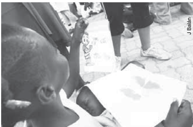
An art lesson comes with a public health message in a Cuban medical team outreach program.

By the end of 2010, nearly a dozen such 'triangular cooperation' agreements had been negotiated to support Cuba's health efforts in Haiti.