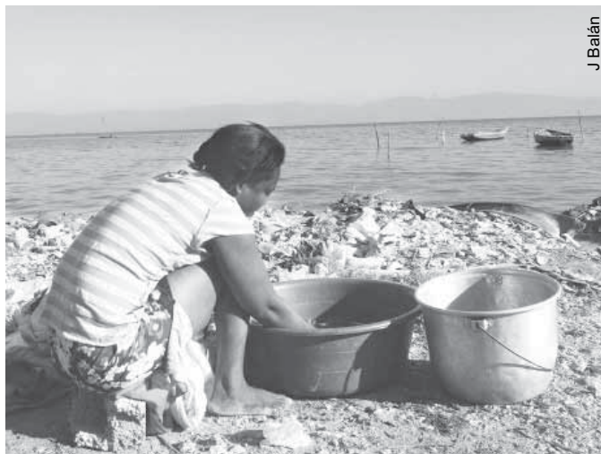
The waters of Haiti's Artibonite River: washing, bathing, cooking... and unsafe to drink.