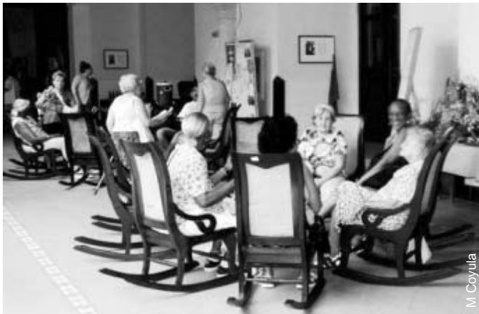
Figure 2: Common Areas of Assisted-living Units in Remodeled Buildings of Old Havana