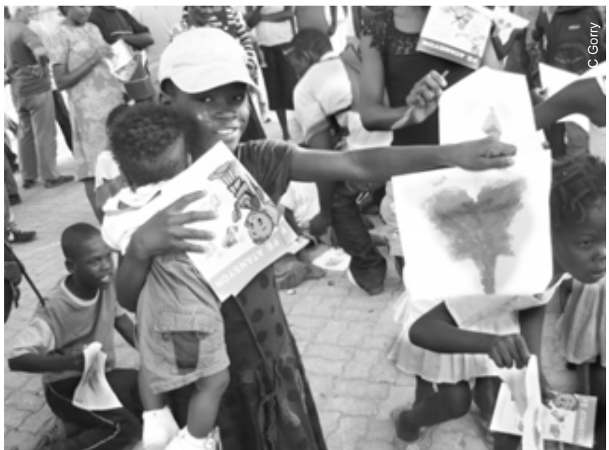
"...children again, one hundred percent."

Providing a role for children and youth in the common effort to return to "normal" is an important mechanism in confronting collective trauma. Thus, medical consultations are followed by the