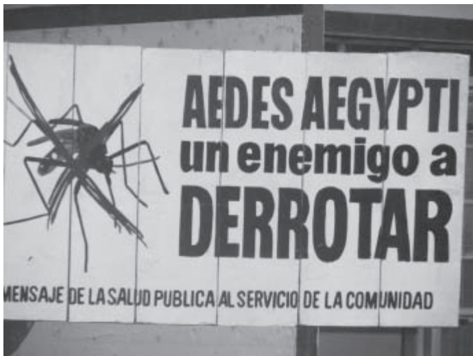
Public health billboard during campaign against dengue carrier mosquito Aedes aegypti .

These plans also include activation of the Integrated Medical Emergency System (SIUM), first responders in times of disaster. Under normal conditions, the SIUM's life-saving and rescue operations provide transportation and vital support for individual patients until they can be stabilized in polyclinic or hospital emergency services. Like all institutions in the health system, SIUM prepares on the municipal, provincial and national level for disasters involving massive victims.