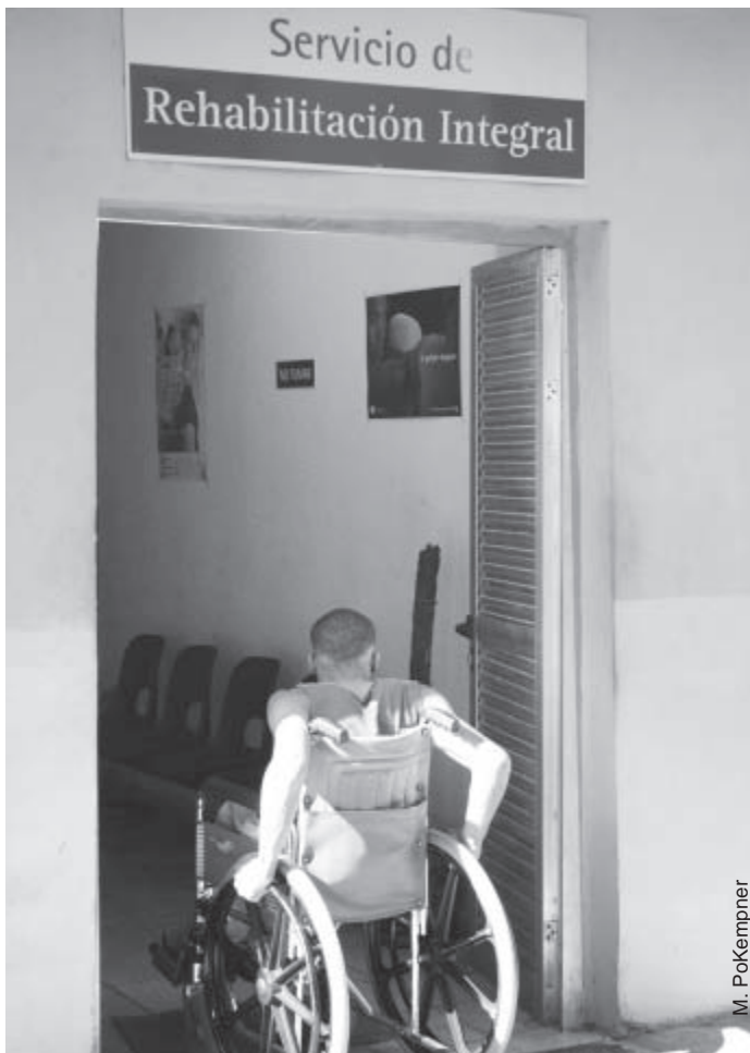
A remodelled community polyclinic in Havana: with repairs came new services such as physical therapy and rehabilitation.

Over 250 of the country's 498 community polyclinics and a number of older hospitals have been refurbished in the same period. Others are in process of remodeling. However, this does not automatically offer sufficient protection: some installations, for example, are located in particularly vulnerable spots – such as the America Arias Maternity Hospital in Havana, just a few blocks from the shoreline.