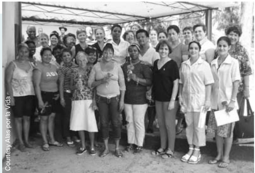
Breast cancer support group in Batabanó.

The first, and now largest, breast cancer support group was started in Havana in 2003 by a few surgeons and their patients who had undergone a radical or partial mastectomies. For these women and the majority diagnosed with breast cancer in Cuba, surgery is the most common shared experience with the disease, and they refer to themselves as 'operadas' (operated on) or 'mastectomizadas' (mastectomized), rather than 'survivors' . However, the group's name, Alas por la Vida (Wings for Life), symbolizes the spirit of hope and determination uniting these women.