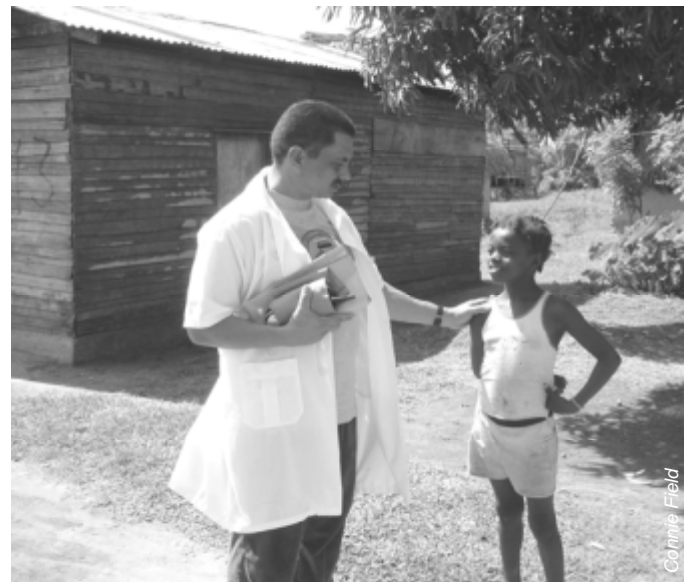
Cuba currently has some 30,000 health professionals volunteering in over 60 poor countries. Often, they are serving in the most remote communities, like this physician in the Garifuna village of Tocamacho, Honduras.

ELAM is preparing doctors with critical skills for the global health workforce. In Working Together for Health , WHO says "countries [should] work together, as individual national strate-